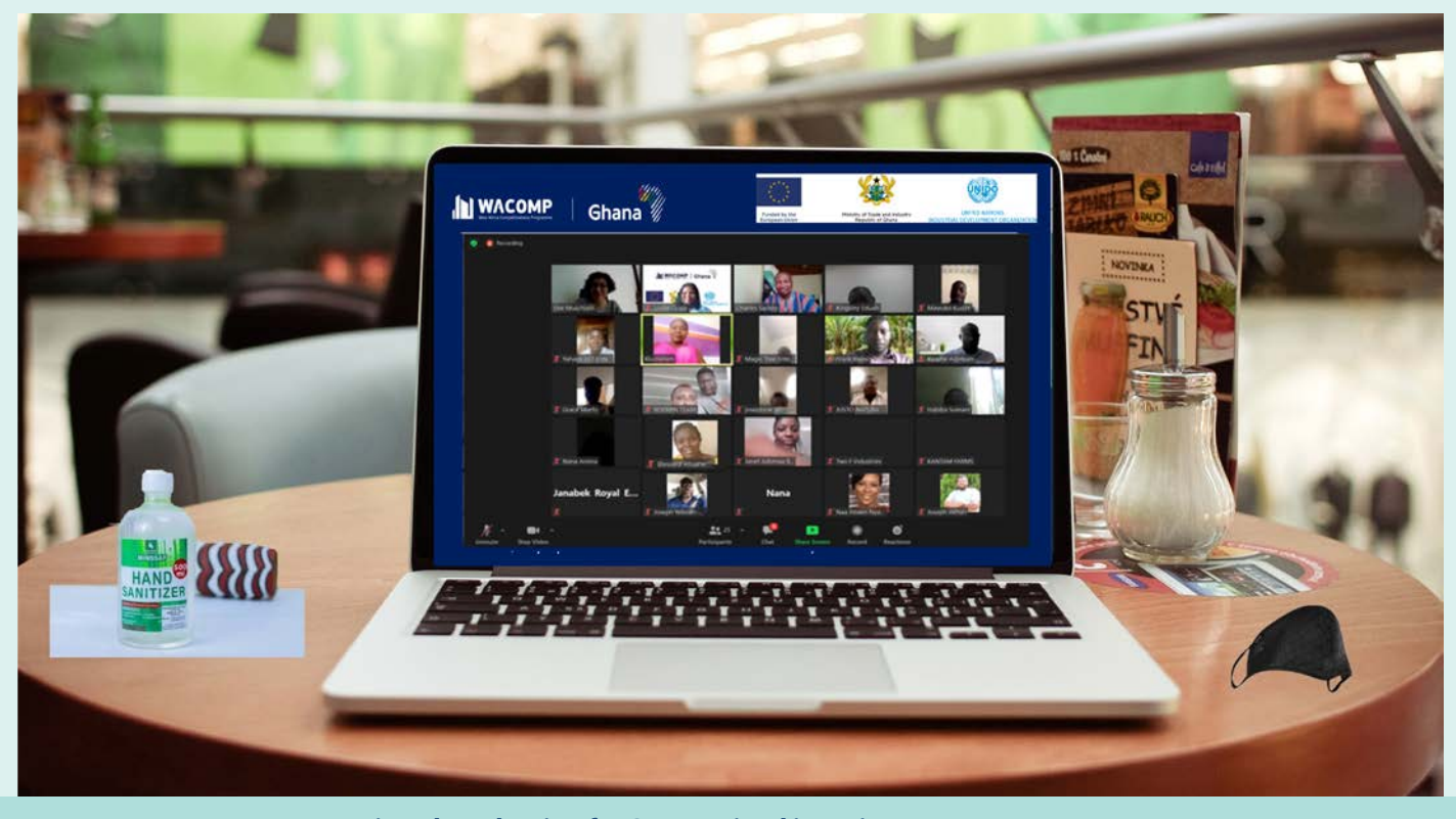
Virtual graduation for SMEs trained in E-Finance

WACOMP - Ghana, in collaboration with the Ghana Enterprises Agency (GEA), formerly National Board for Small Scale Entreprises (NBSSI), held on the 4th of May 2021 the virtual graduation for 22 SMEs who completed a six weeks' course on financial aspects for SMEs.