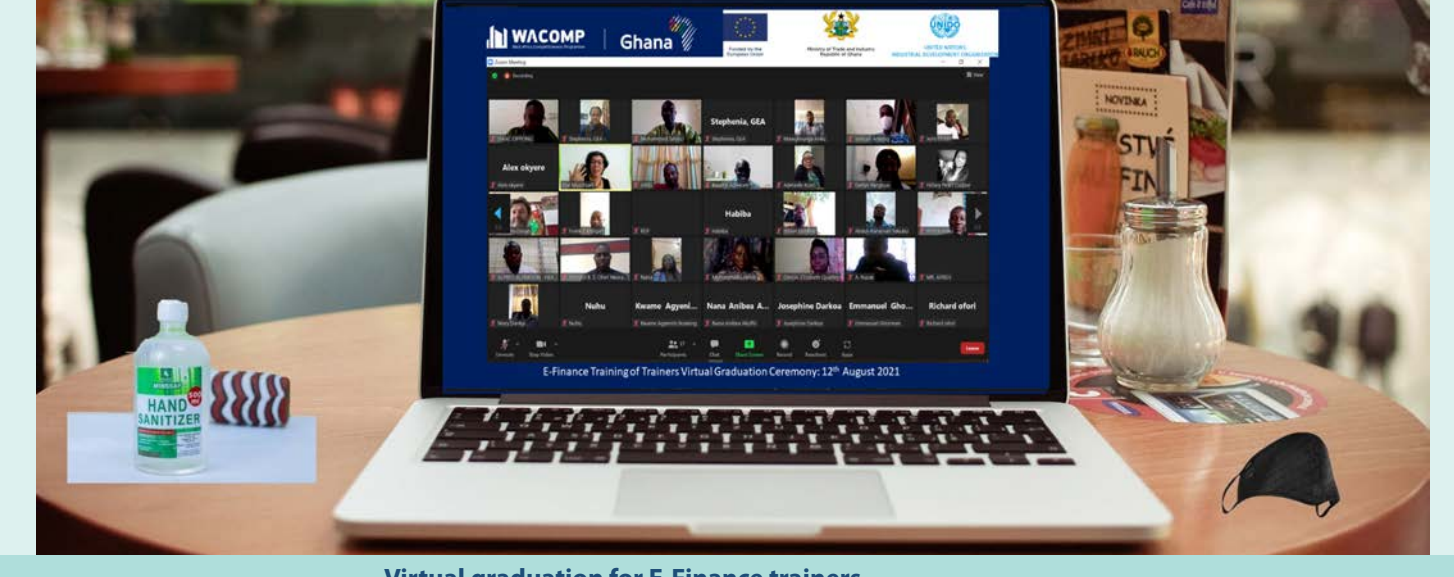
Virtual graduation for E-Finance trainers

As a joint initiative between WACOMP and Ghana Enterprises Agency (GEA), the training of GEA staff on financial issues was launched on the 17th of July 2021. 41 staff from regional offices and the headquarters of GEA attended the course.