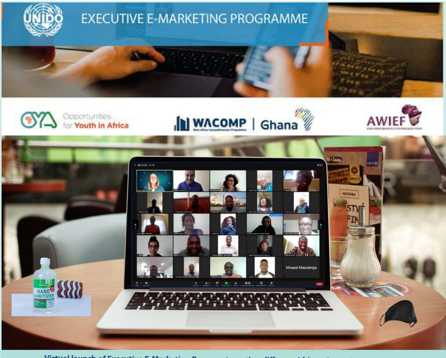
Virtual launch of Executive E-Marketing Program targeting different African Countries

WACOMP - Ghana, in partnership with Africa Women Innovation and Entrepreneurship Forum (AWIEF), and Opportunities for Youth in Africa (OYA), launched on 15th of June 2021 another edition of the Executive E-Marketing Program.