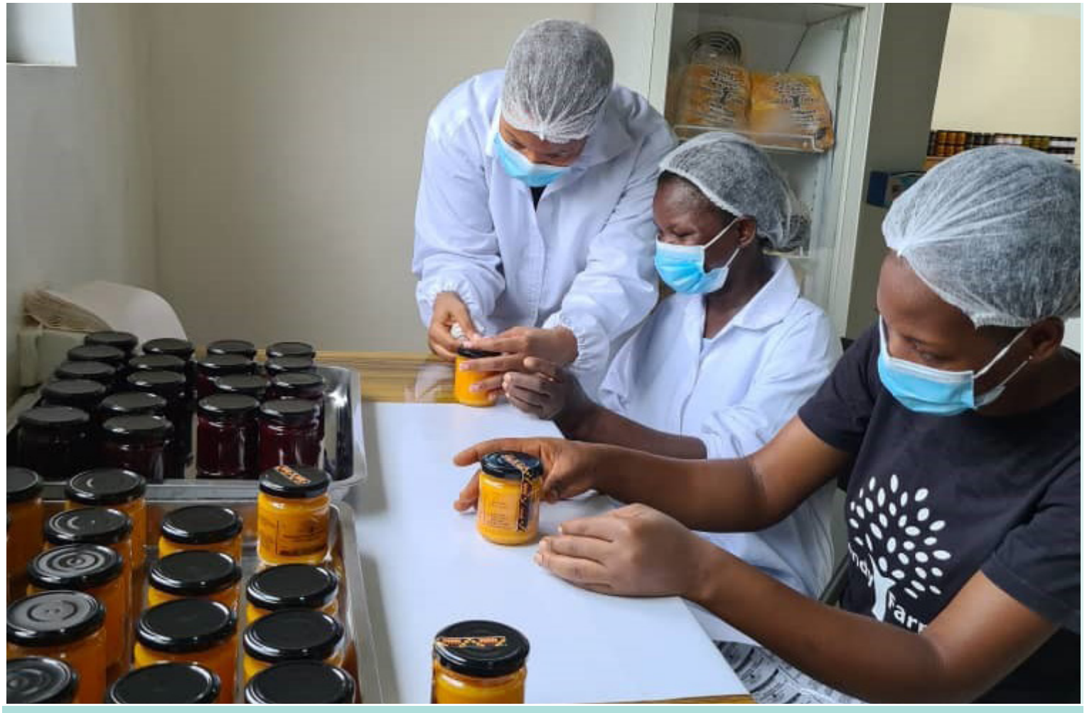
Mango jams packaging at the Hendy Farms factory

WACOMP - Ghana is supporting the capacity of the Dodowa and Somanya mango cluster to process mango into jams, mango chutney and dry fruits to reduce high post harvest losses.