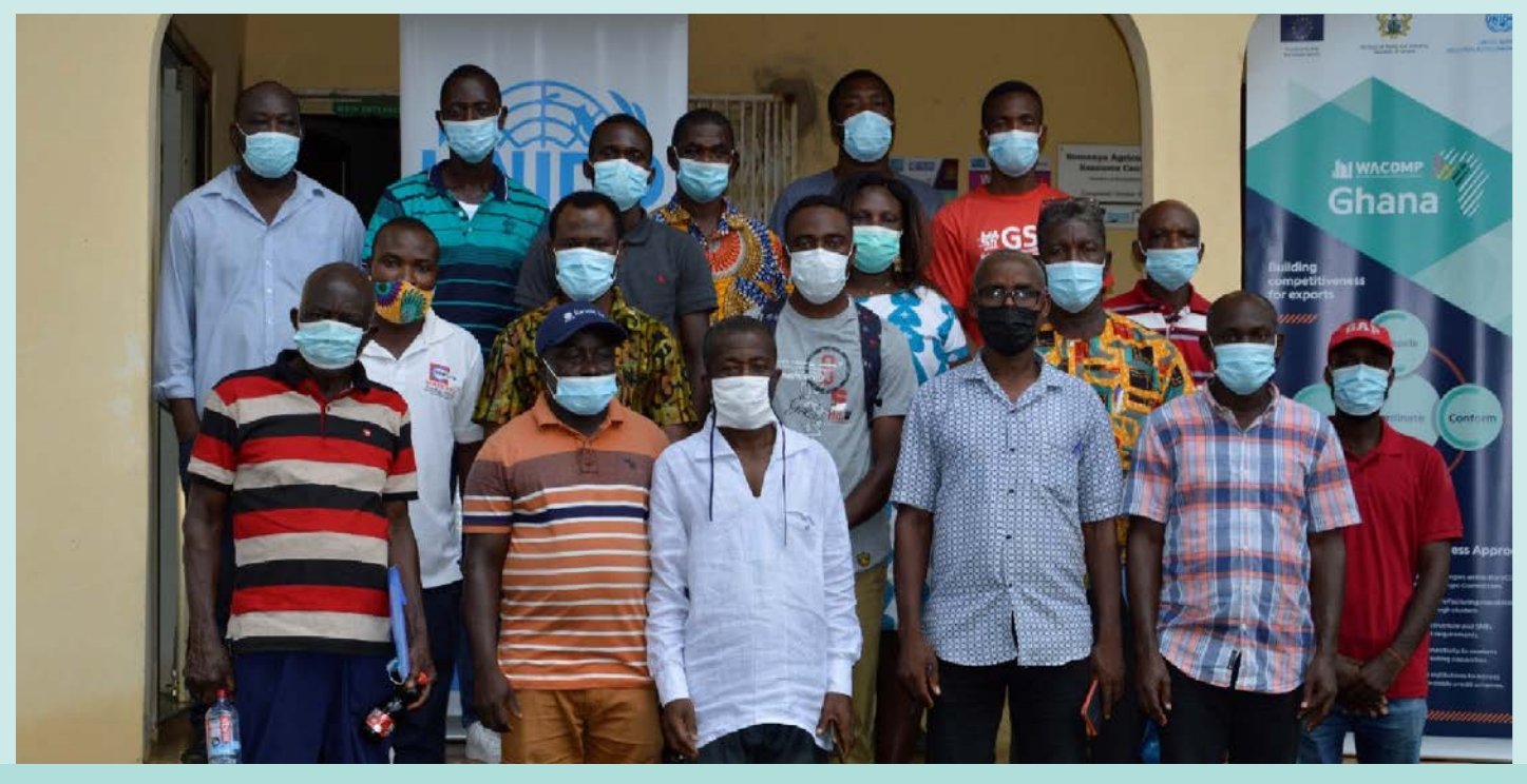
Participants of the mango financial training

WACOMP- Ghana organized a 6-day financial training and recordkeeping for 75 mango and pineapple producers in the Eastern and Greater Accra regions to promote good record-keeping systems and realistic forecasting.