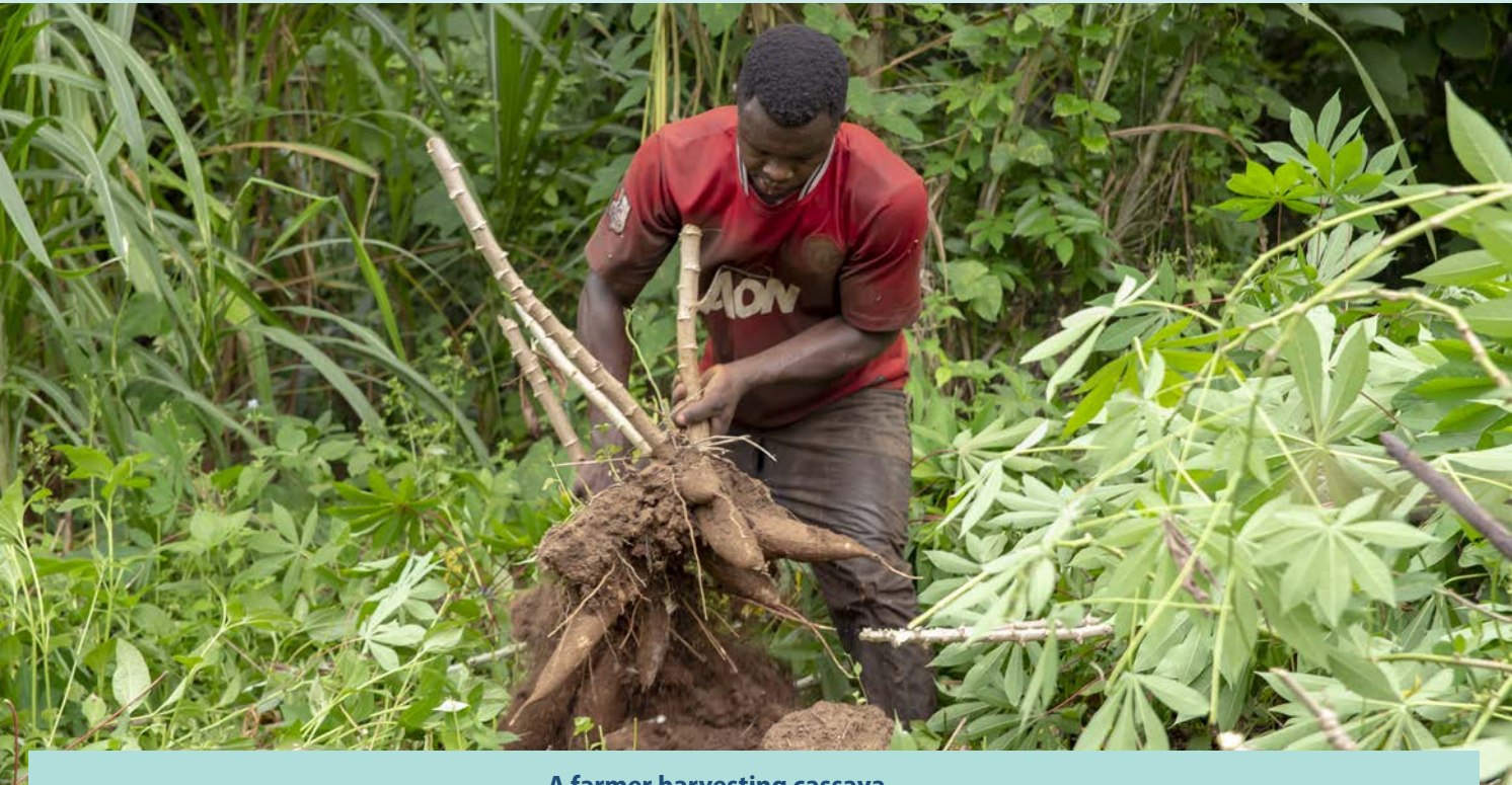
A farmer harvesting cassava

Over 230 out-grower farmers in Abura Asebu Kwamankese and Nyame Bekyere linked to Tropical Starch Company Limited to produce and supply quality improved cassava derivatives and to obtain product certification