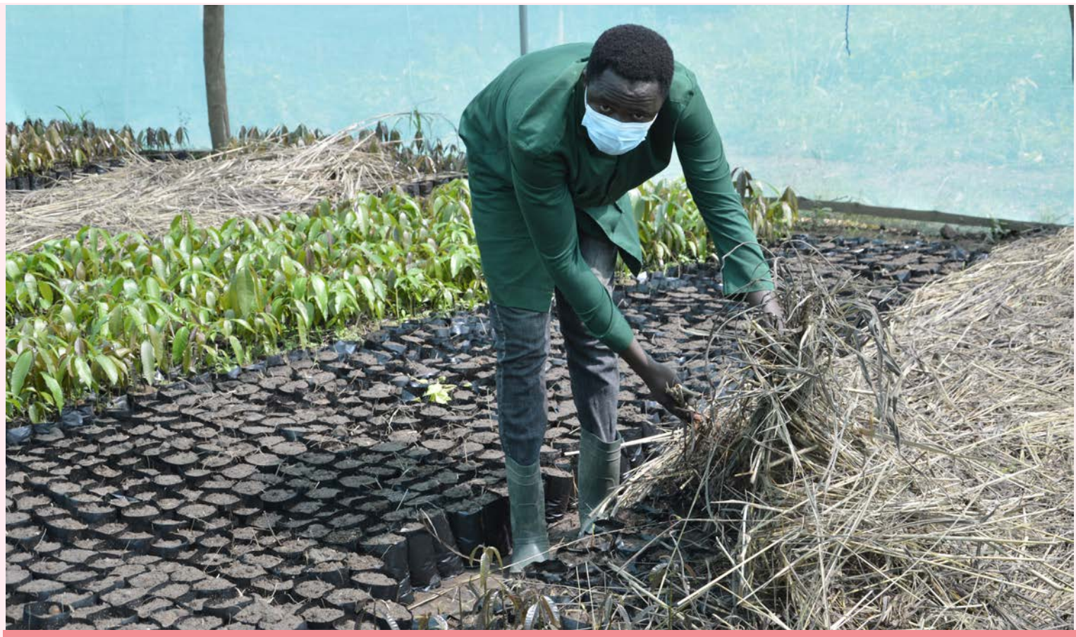
A mango outgrower inspecting the mango seedlings at the model nursery farm

WACOMP - Ghana in partnership with Cotton Weblink Limited, a subsidiary of the Farm Management Services Limited (FMSL), has set up 12 model mango demonstration nursery farms.