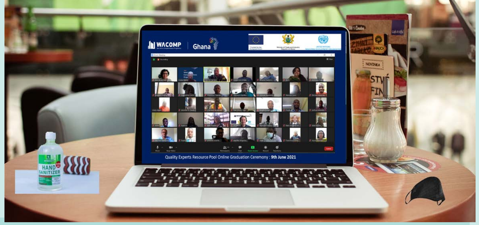
Virtual graduation ceremony for the quality experts

The project on 6th of May, 2021 launched a resource pool quality training to increase the number of national experts and enhance experts' knowledge on ISO 22 000, ISO 9001, and ISO 22 716.