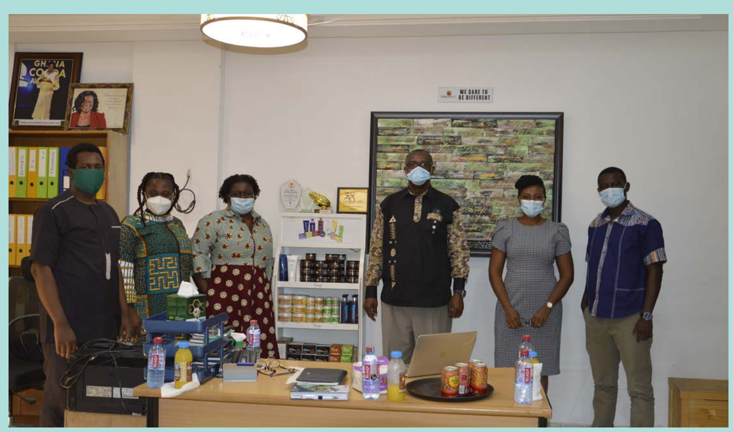
WACOMP - ECOWAS delegation at the Solution Oasis Limited - producers of Beauty Secrets range of cosmetics