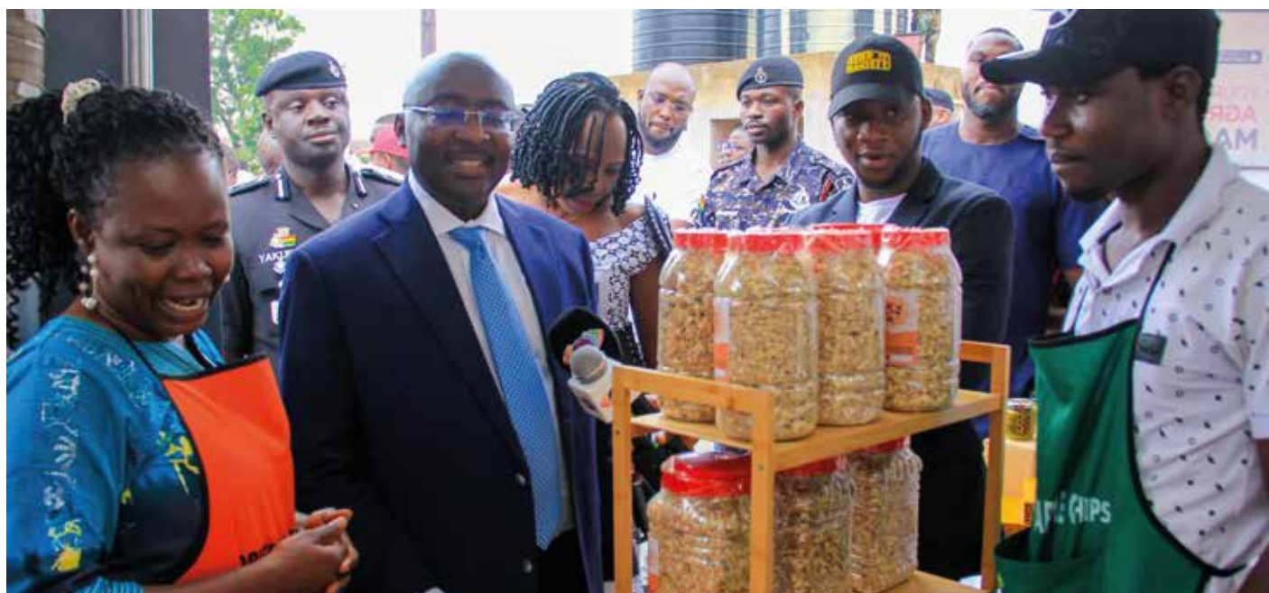
The vice President, Dr. Mahamudu Bawumia visiting, 'Jozy Snacks' at the European Union WACOMP Stand to interact with the SMEs

The SMEs supported by WACOMP – Ghana had the chance to exhibit at the 'This is Ghana' Exhibition, alongside other entrepreneurs directly supported by the European Union.