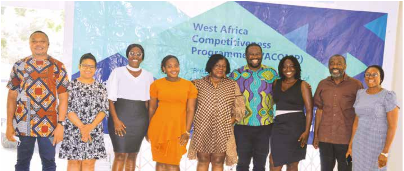
Group photo of Cassava Value Chain Sub - Committee members

The Cosmetics Value Chain Strategic Committee (VCSC) held a meeting on 25th May 2022 to discuss the progress on cosmetics and personal care activities included in the Sector Export Marketing Plan (SEMP), to maximise the export potential of cosmetics from Ghana.