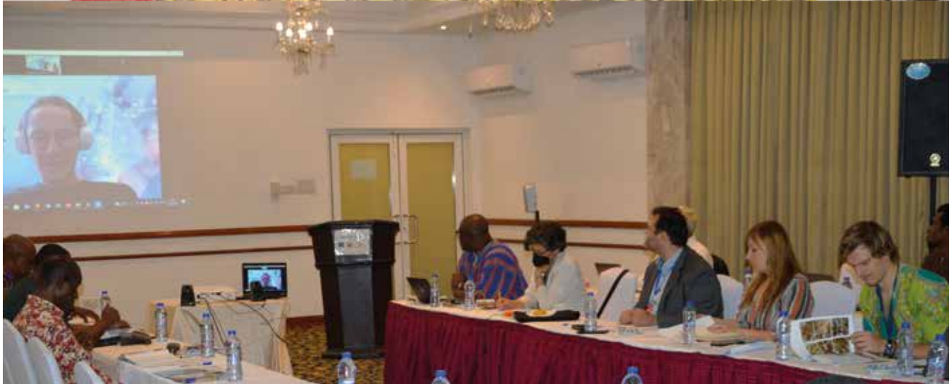
Members of the WACOMP - Ghana Steering Committee in a hybrid meeting on the project progress

WACOMP – Ghana , held its 5th Steering Committee (SC) Meeting on the 10th of June, 2022 to discuss the progress of the project and provide recommendations for further action for implementation.