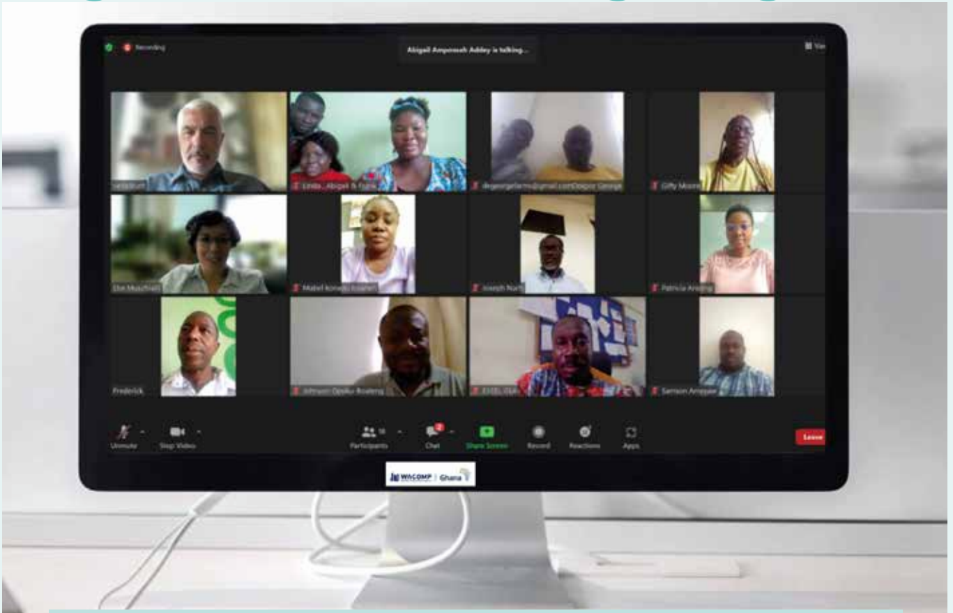
Representatives from various cluster management organisations in one of the virtual class sessions

To contribute to innovation and ensure Inclusive and Sustainable Industrial Development (SDG 9), the project launched Cluster Management Organizations (CMO) strengthening Programme is in the third phase