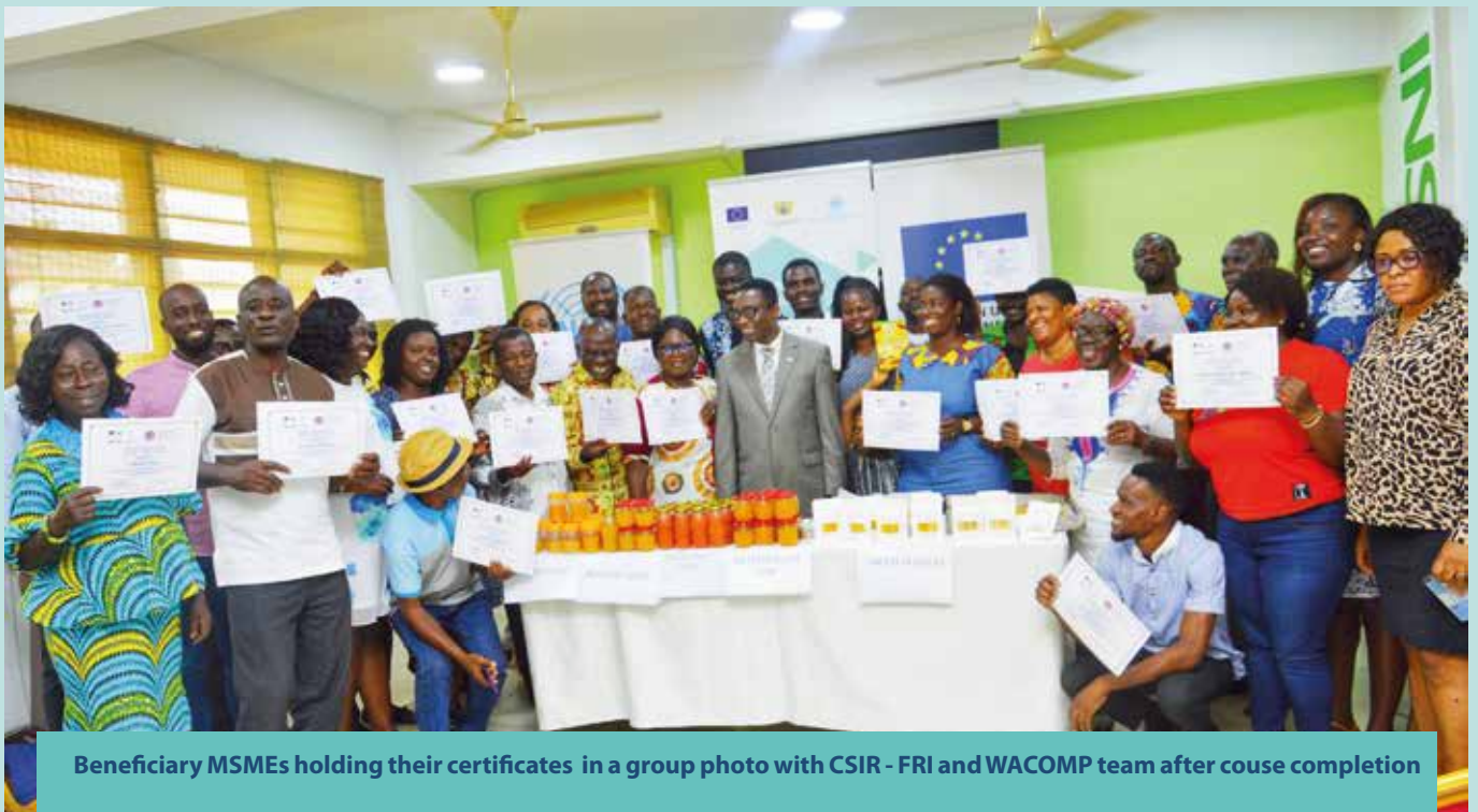
Beneficiary MSMEs holding their certificates in a group photo with CSIR - FRI and WACOMP team after course completion

As part of differentiating the products issued from the target value chains, WACOMP – Ghana organized a training workshop on fruit juice processing and fruit jam preparation targeting SMEs operating in the mango and pineapple clusters.