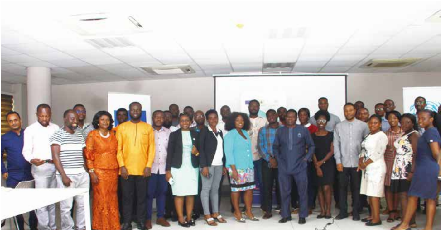
Participants from various 1D1F factories across the country in a group photo

WACOMP-Ghana, in close cooperation with the Ministry of Trade and Industries (MoTI) and the 'One District One Factory' Secretariat, organized a two-day quality assurance training for companies benefitting from the 'One District One Factory' programme.