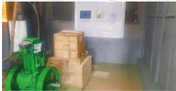
New processing centre of the Asuogya Cassva cooperative with new equipment provided by WACOMP-Ghana