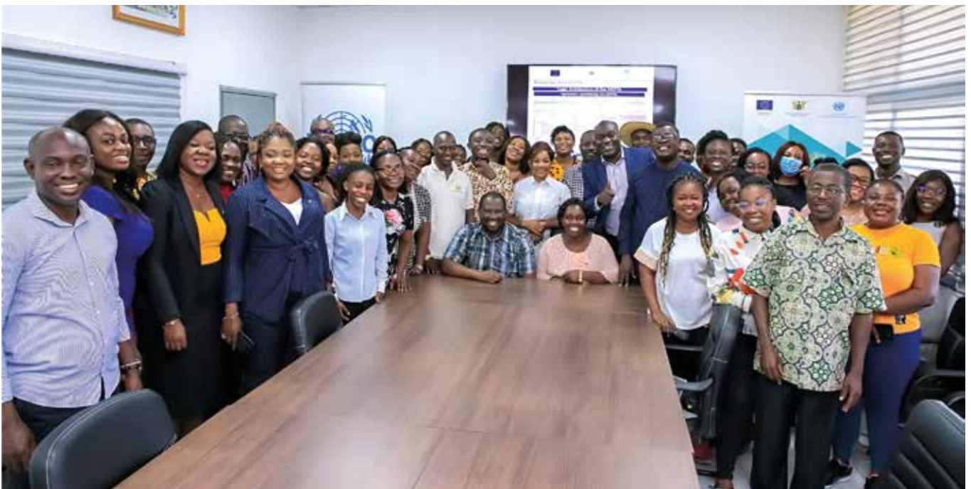
Group photograph of participants of the AfCFTA 'Rules of Origin' training

Knowing which country to export to and meeting market requirements are crucial for businesses particularly for Small and Medium Scaled enterprises (SMEs).