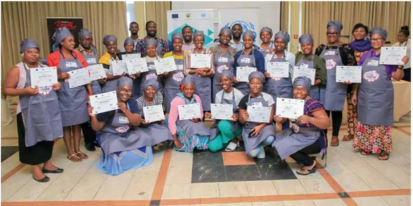
Group photograph of participants showing their Masterclass Certificates

20 Small Medium Scale Enterprises (SMEs) took part in a handcraft soapmaking masterclass, organized by WACOMP-Ghana from 2nd – 5th August 2022 in Accra.