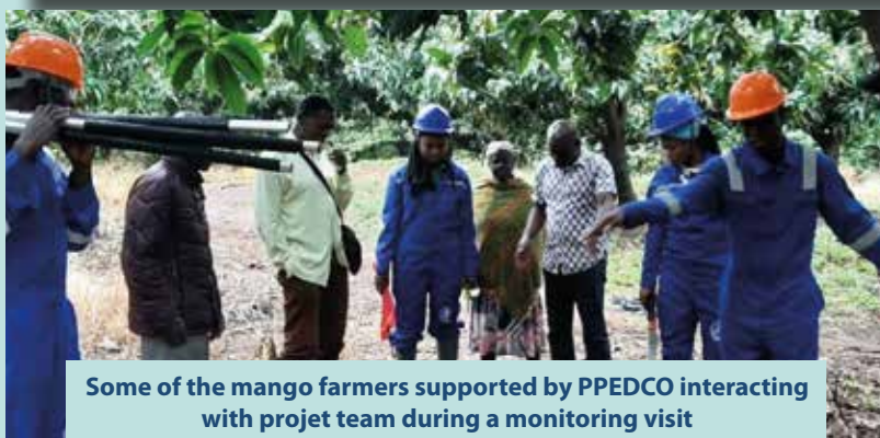
Some of the mango farmers supported by PPEDCO interacting with project team during a monitoring visit

Mango farmers within the catchment area of PPEDCO have been well trained in Good Agricultural Practices (GAPs) in Mango Production, Quality Mango Production Standards that meet the international fruit production standards and in marketing skills.