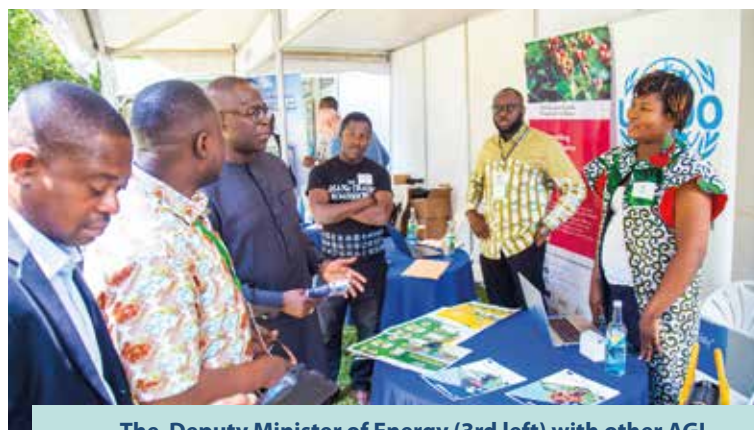
The Deputy Minister of Energy (3rd left) with other AGI executives visiting the WACOMP stand

The project used the opportunity offered by the exhibition to share more with the public about WACOMP support for the AfCFTA, MSMEs, Industrialisation and connection to the Sustainable Development Goals (SDGs).