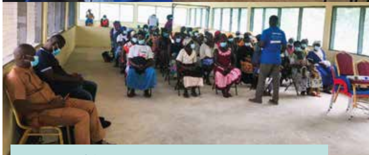
Some of the training sessions in pictures