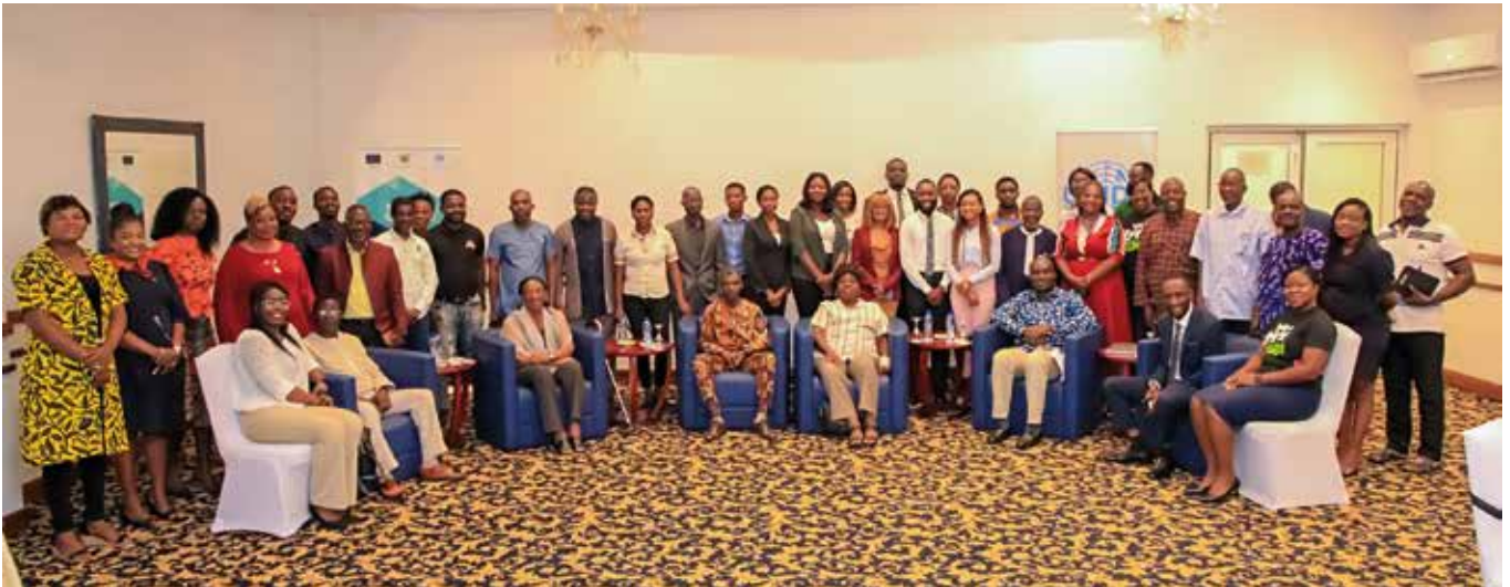
Group photograph of delegates from different working partners and WACOMP Cassava Value Chain Clusters

The cassava value chain in Ghana is supported by many service providers including processing equipment manufacturers and more recently, packaging, showcasing the importance of the increasing innovation within the sector.