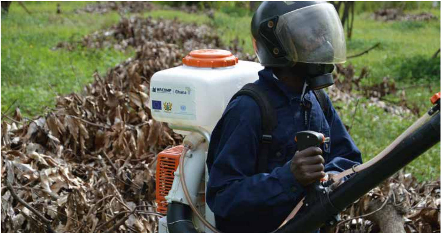
An officer of PPEDCO spraying a mango farm to prevent diseases

Within the Sub-Contracting Matching Scheme provisions of WACOMP-Ghana, the Plant Pests and Diseases Control Company Limited (PPEDCO) have trained and provided technical farm assistance on agronomic practices and plant protection techniques for the efficient control of Bacterial Black Spot (BBS) and fruit flies.