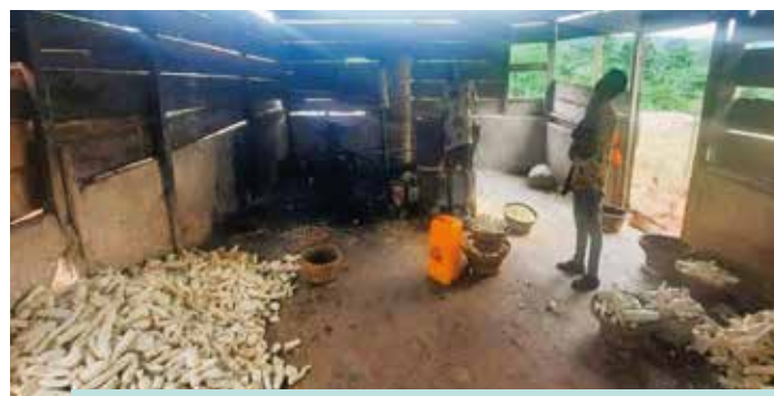
Old processing centre of the Asuogya Cassva cooperative

In the end, 45 processors are now equipped for operating and maintenance of the equipment.