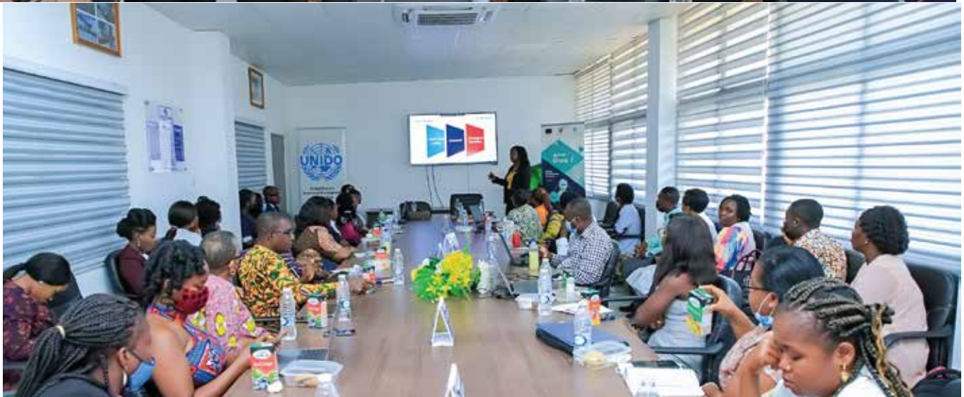
Access bank team taking participants through available financial options for MSMEs offered by the bank

Financial access is critical for the growth of SMEs.