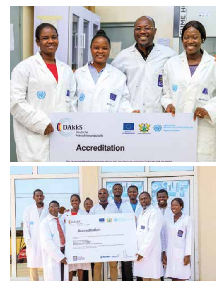
Watch the appreciation message of the GSA Cosmetics Unit to the European Union and UNIDO via the project's <u>YouTube</u>

Ghana affirmed: "The support to GSA further strengthens the already successful partnership to make products and services from Ghana globally competitive and strongly contributes to promoting intra-African trade."