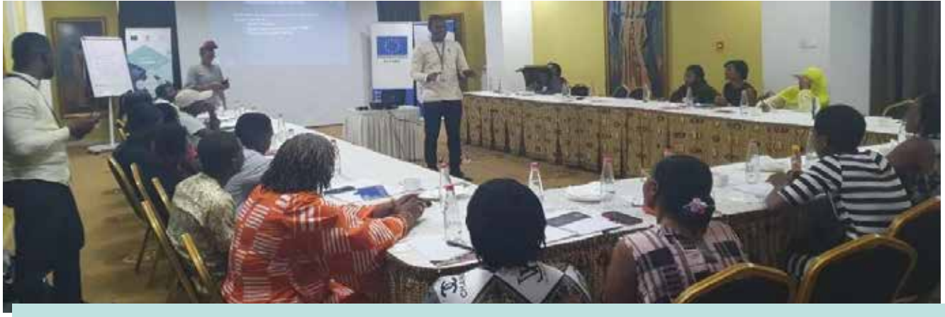
Kumasi cosmetics cluster GMP training

The project organized a two-day training in Good Manufacturing Practices (GMP) according to the guidelines of ISO 22716:2007 for primary cosmetic producers.